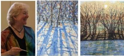
Sharon Somers – Watercolor & Watercolor Batik