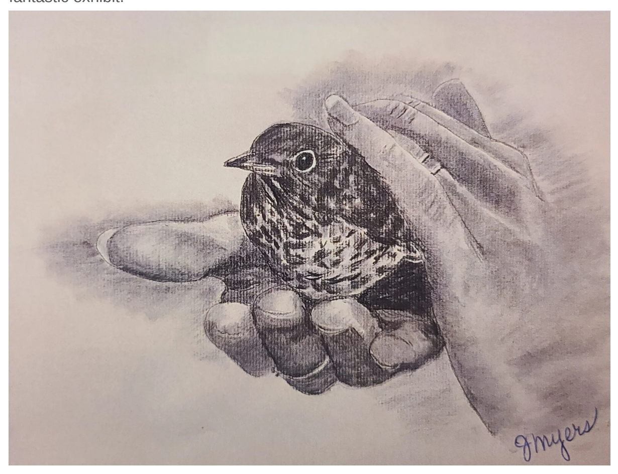
Upcoming Exhibits at Peoria Heights Library

our talented artists! Be sure to stop by the library during normal hours to see this fantastic exhibit.